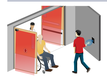
Full Energy Swing Doors