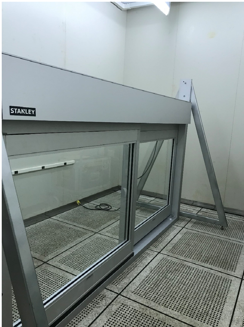
Figure 4. ProCare 8300A Automatic Sliding ICU Isolation Room Door Setup

upon opening and closing. A TSI particle counter having a 1.0 CFM sampling rate and connected to the GORPLER™ sampling array, having 60 precision-bore sampling points over the 1.25 ft 2 sampling area, was utilized for both the background and door-operating data gathering. Instrumentation specifics can be found in the Instrumentation Calibration section of this report.