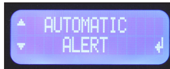
Works with MC-521 Pro controller and safety sensors to alert of door issues