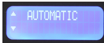
Home Screen indicates current operating mode of the door