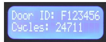
Displays door information including: diagnostics, door identification and cycle count