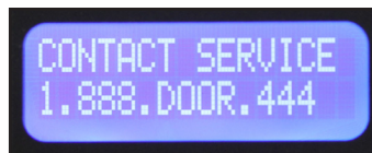
Lists contact information when prompted or as necessary